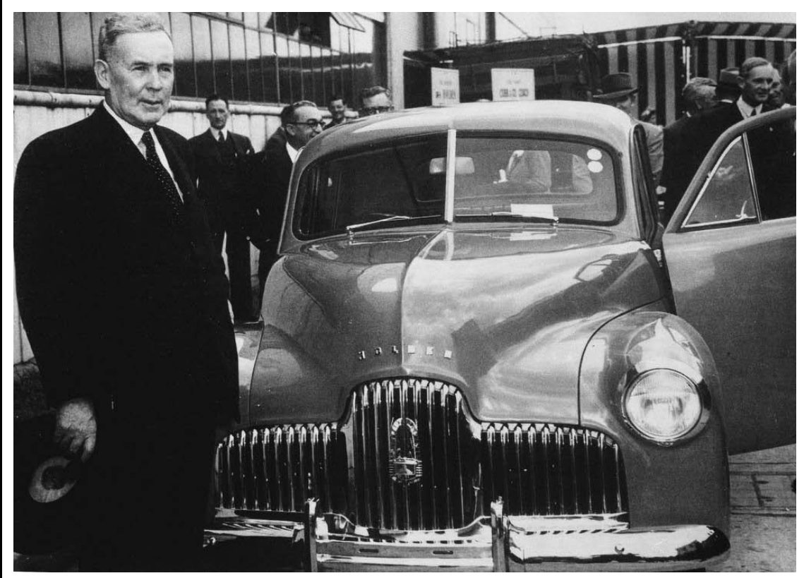
Holden 48-215 Launch, November 1948

Holden Cars have become iconic motor vehicles in Australia since 1948. The Holden family history since 1854 and the development of today's General Motors Holden are featured. Classic Holden Cars, looks at the company development and growth in Australia along with information and pictures of every Holden from the first Holden manufactured in Australia, the 48-215 FX (1948) to the 2006 VE Commodore. You will find production numbers, the base price on introduction to the marketplace and as many pictures we could find.